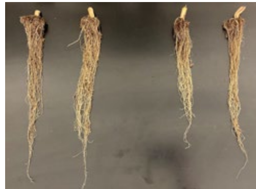
Tennyson roots primed shown against unprimed